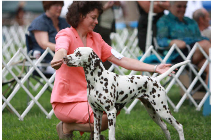
Here is Sara handstacked at the Greater Denver Dalmatian Club shows.