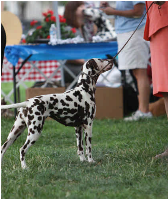
Here is Sassy Sue freestacking at the Greater Denver Dalmatian Club shows.

The previous week we took a trip to Colorado where my "Sassy Sue", JLS Full of Sass (L) took a specialty supported 4 pt major RWB!